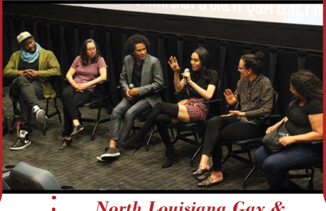
North Louisiana Gay & Lesbian Film Festival Saturday Church 9.8.18