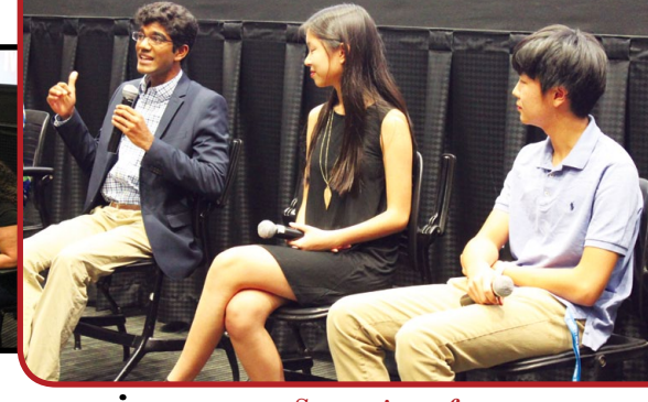
Screening of Science Fair 11.3.18

Regional Filmmakers Spotlight Rodents of Unusual Size 8.26.18