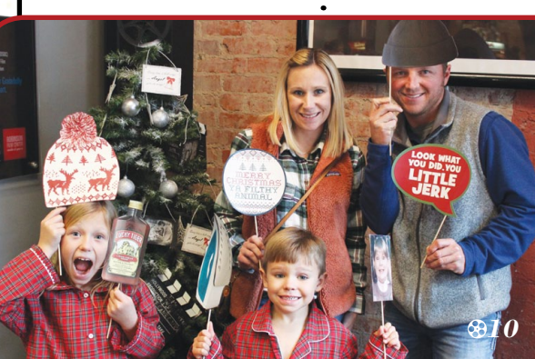
Family Matinee Home Alone 12.8.18